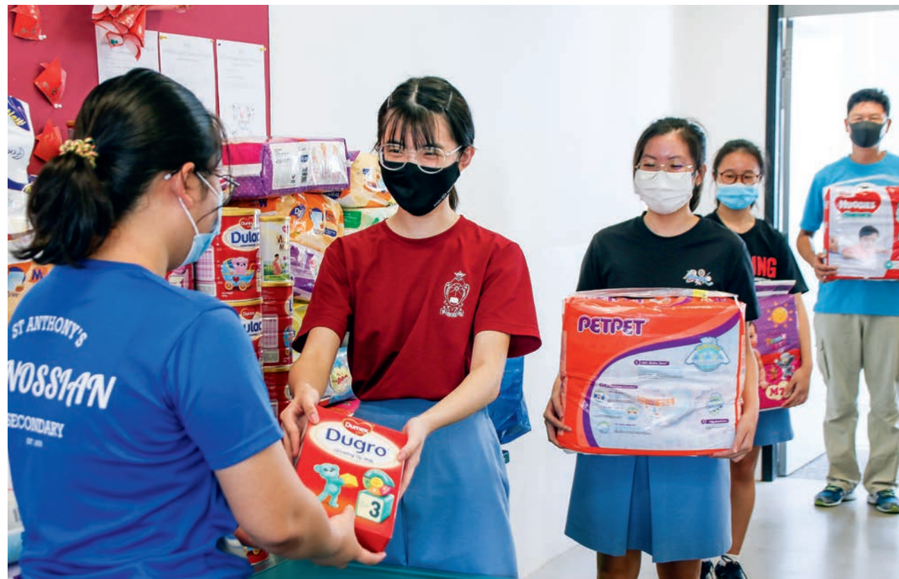
Collecting milk powder and diapers for distribution in support of their cause.