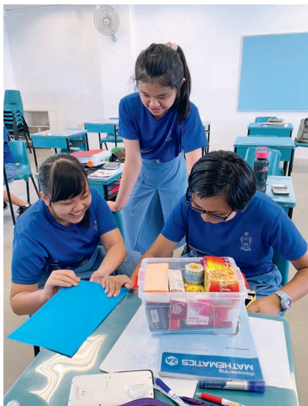
Assembling "Stay Strong" packages for Foundress Day (pre-Circuit Breaker).